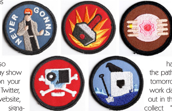
Just a few of the proposed badges in beta right now...

ers gained roughly 10% of all ~100,000 badges currently available in the first week. With badges obtainable ranging from "Adopted a Puppy" to "Volunteer at the Homeless Shelter," the human condition in almost every major discipline has